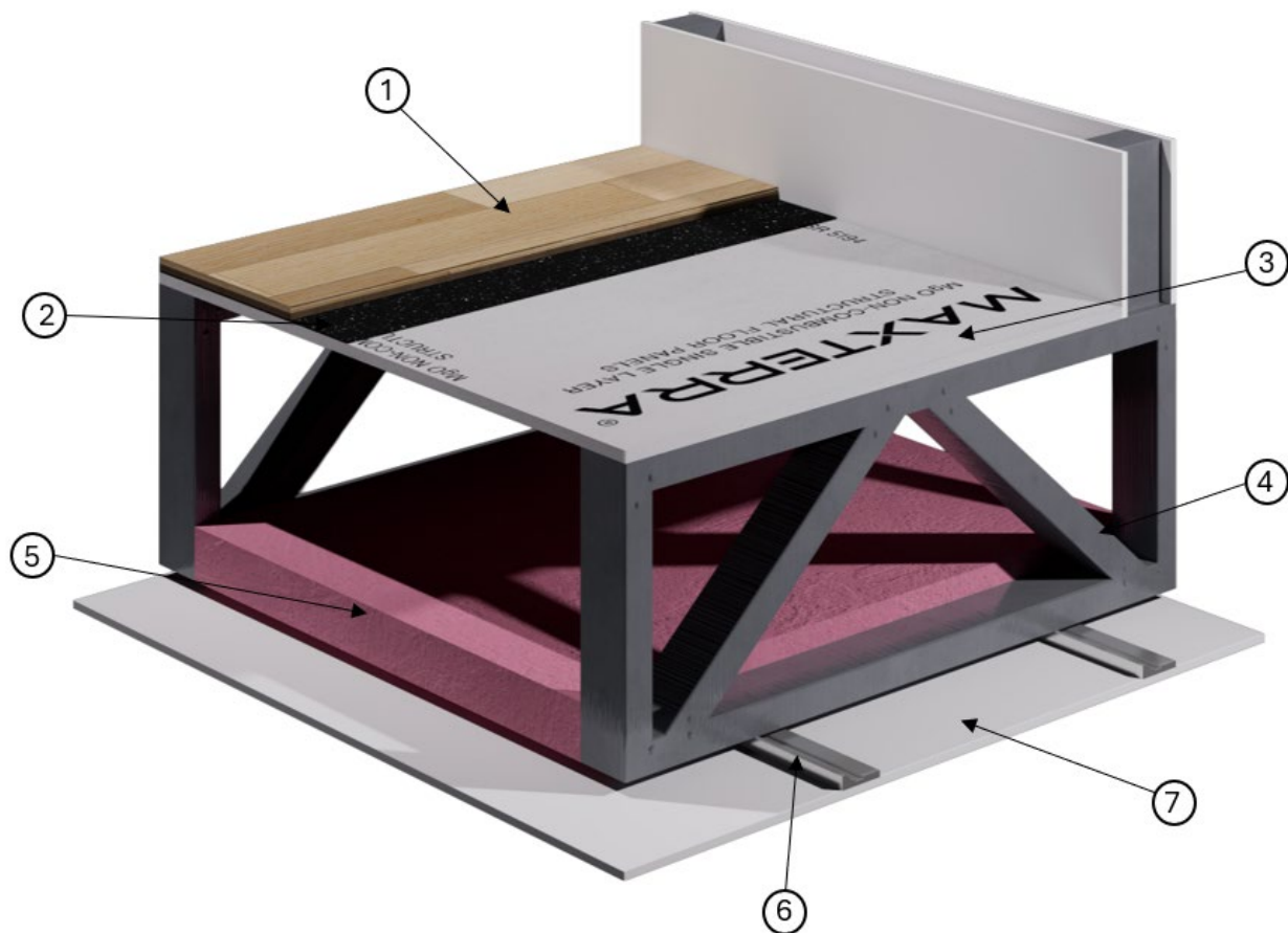
FIGURE 1 – COLD FORMED STEEL TRUSS FLOOR-CEILING ASSEMBLY

Acoustical Performance Ratings: (See MOS-1645-02 Figure 1, Table 1)